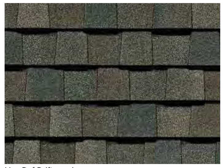
Max Def Driftwood