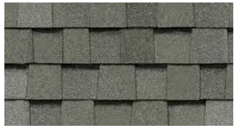
Max Def Cobblestone Gray