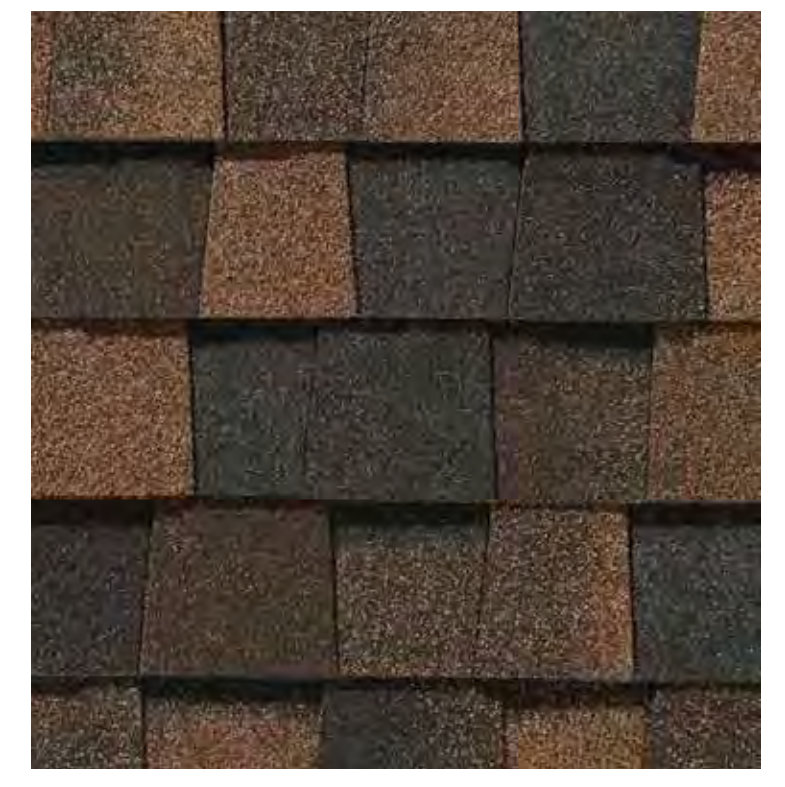
Max Def Burnt Sienna