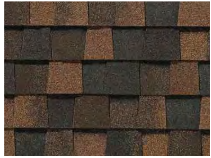
Max Def Burnt Sienna