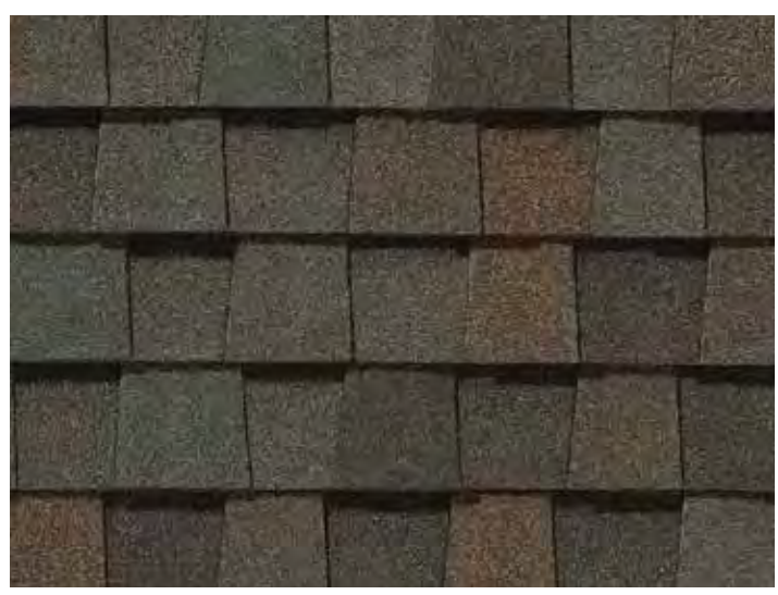
Max Def Heather Blend