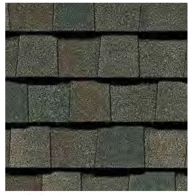
Max Def Driftwood