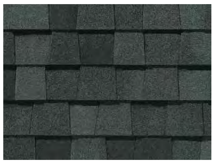
Max Def Moire Black