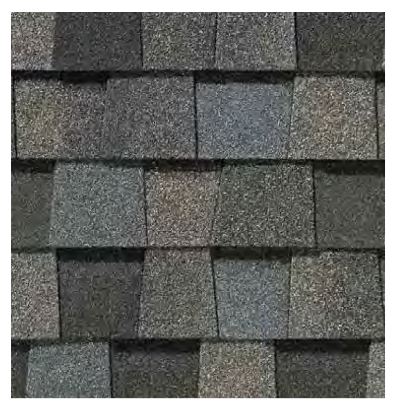
Max Def Weathered Wood