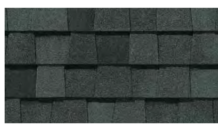
Max Def Moire Black