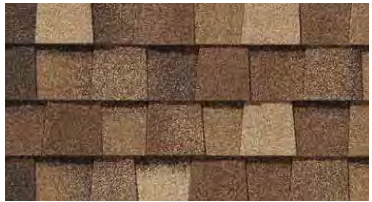
Max Def Resawn Shake