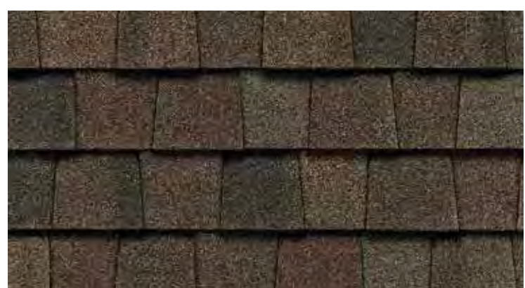
Max Def Shenandoah