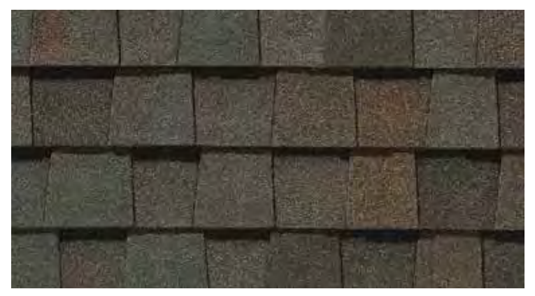
Max Def Heather Blend