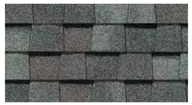
Max Def Colonial Slate