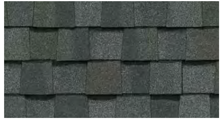
Max Def Pewter