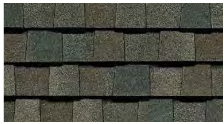
Max Def Driftwood