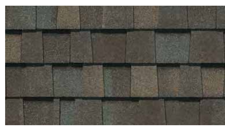
Max Def Prairie Wood