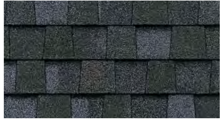
Max Def Atlantic Blue