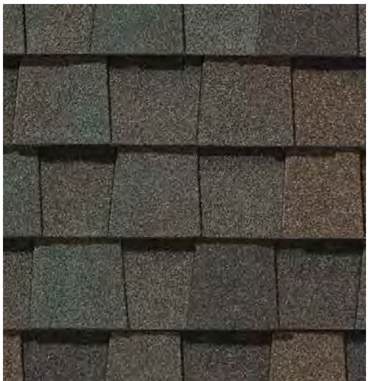
Max Def Heather Blend