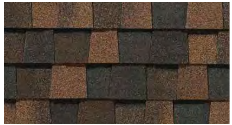
Max Def Burnt Sienna