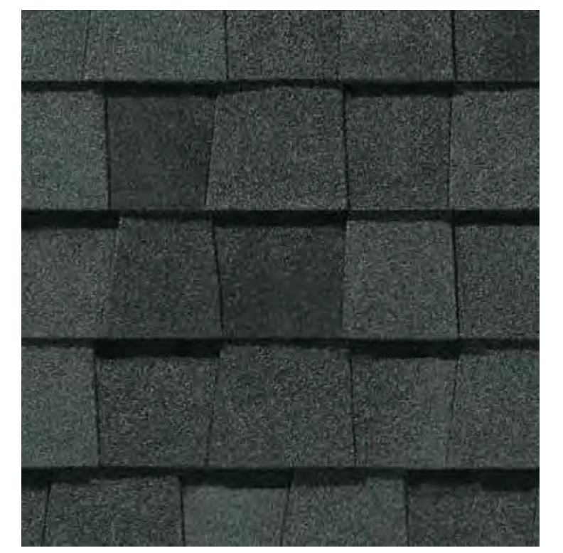
Max Def Moire Black