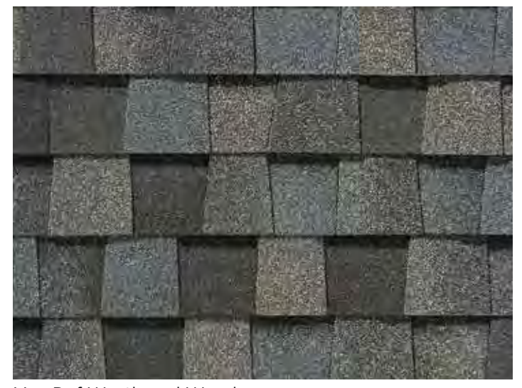
Max Def Weathered Wood