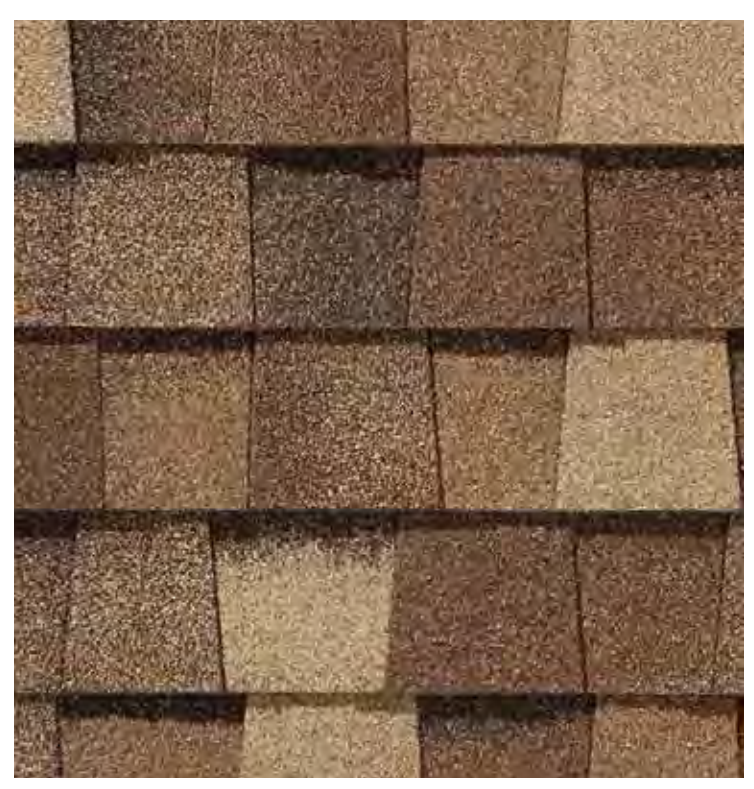
Max Def Resawn Shake