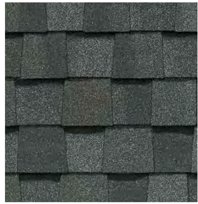
Max Def Pewter