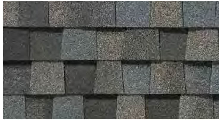
Max Def Weathered Wood